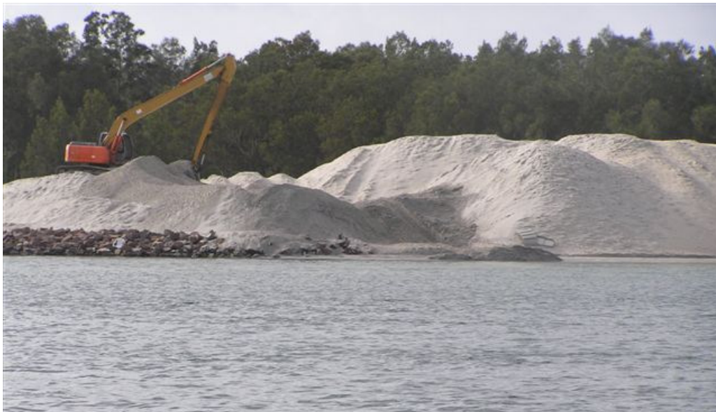
Figure 3 – Naru Point Stockpile Site

In order to reduce the cost of the loader and operator, desired export rates from the site needed to be in the order of 1,000 cubic metres per day or more, about twice the dredge rate. In order to achieve this up to 12 truck and dog trailers were used to remove the sands to various local construction projects located up to 35 km from the site.