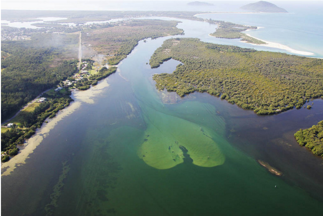
Figure 4: Lower Myall River (Corrie Channel)

The proposed dredging project developed by Council involved the removal of 12,000m 3 of marine sand from Corrie Channel at an estimated cost of $370,000 inclusive of all investigation and design, environmental assessment and approvals, on-ground works, rehabilitation, supervision and project management. Under the Waterways Program, Council is responsible for all components of the project with technical assistance available from relevant State agencies.