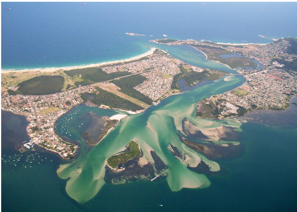
Figure 2 – Aerial Photo of Site January 2009

During the period between 1998 and 2001 a further 50,000 cubic metres of material was dredged from the channel. Most of this material was pumped to Blacksmith's Beach up to 3km to the east of the site.